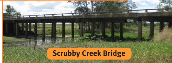
Scrubby Creek Bridge

For more information visit our website www.mainroads.qld.gov.au