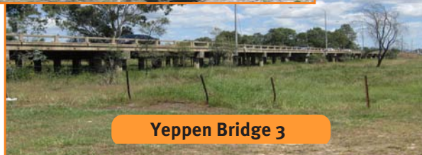
Yeppen Bridge 3