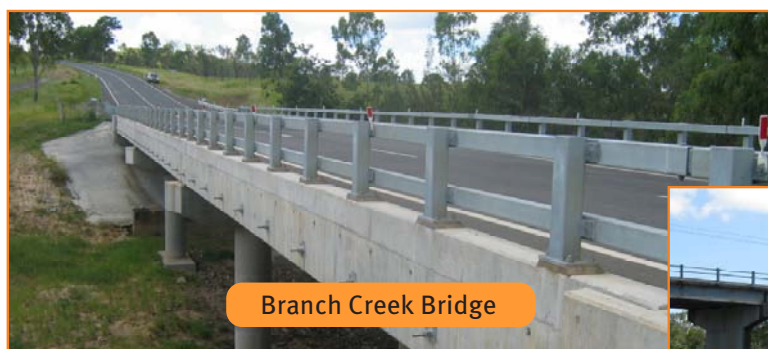
Branch Creek Bridge

Email q15obridges@mainroads.qld.gov.au In the subject line, please put Q150 Naming Project: Boyne River and Branch Creek Bridges