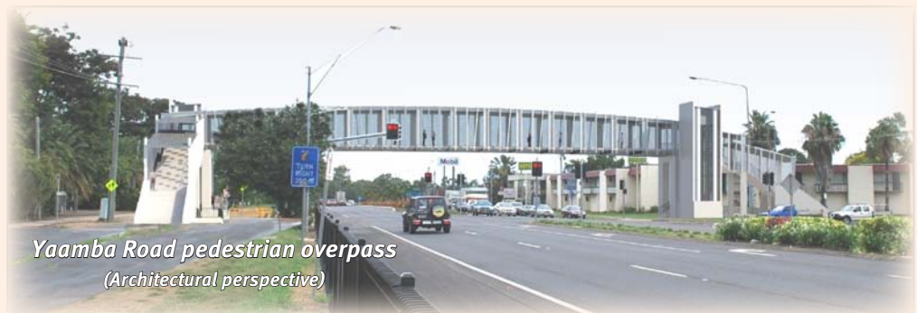
Yaamba Road pedestrian overpass (Architectural perspective)

The pedestrian overpass remains on-track to be open for the start of the 2010 school year.