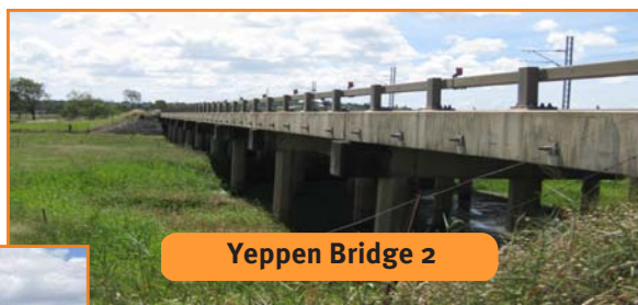
Yeppen Bridge 2