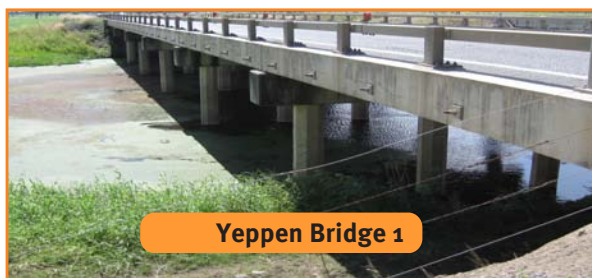
Yeppen Bridge 1

q15obridges@mainroads.qld.gov.au In the subject line, please put Q150 Naming Project: Yeppen and Scrubby Creek Bridges